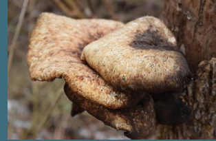
Oyster Mushroom at Dix Park