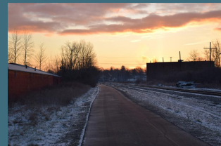
Sunrise on the PORTAGE Hike and Bike Trail