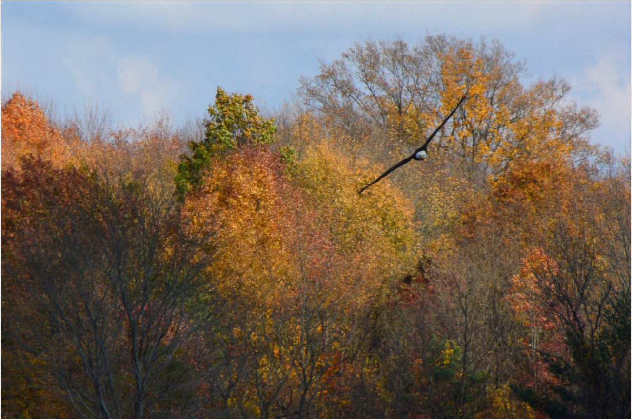
Bald Eagle at Trail Lake Park