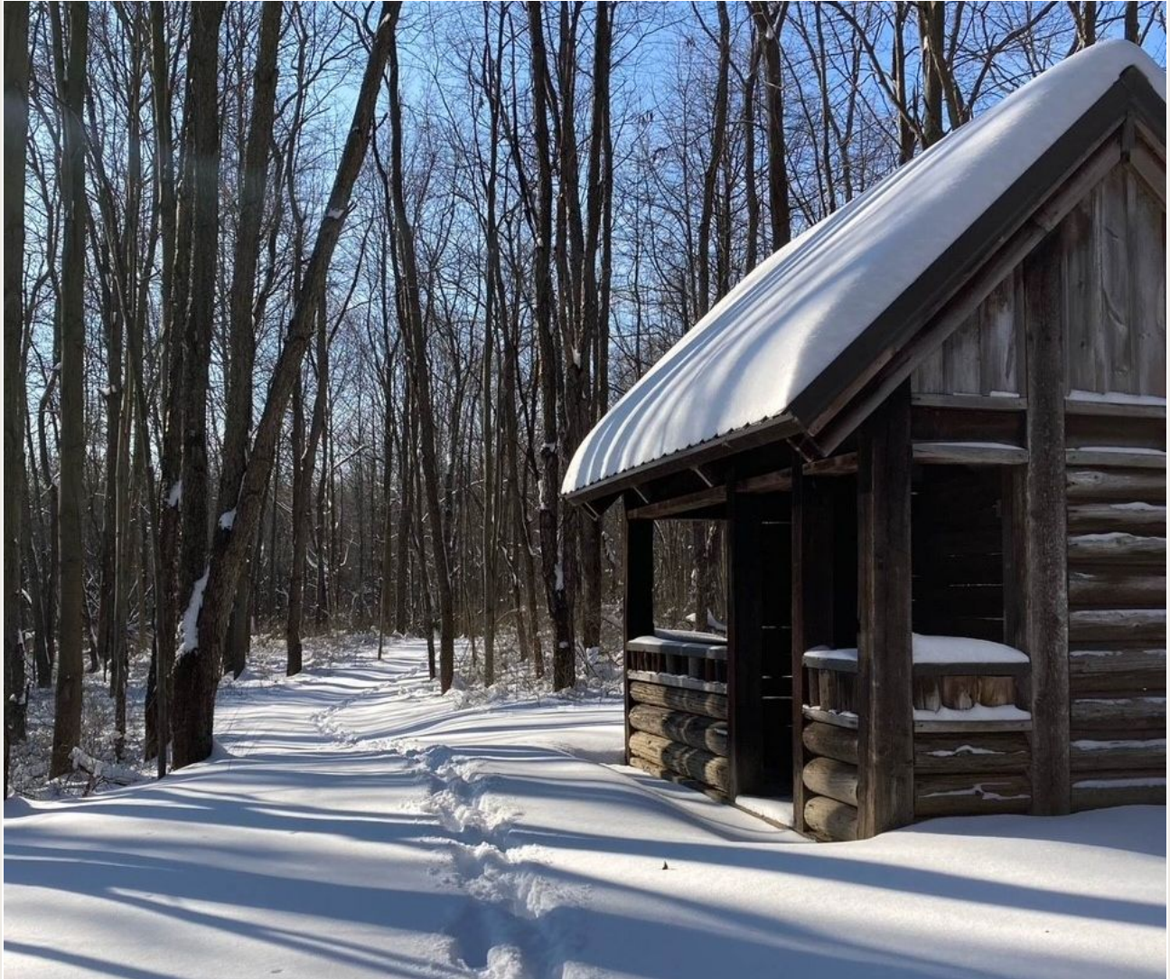
Towner's Woods, Photo: Tom Euclide