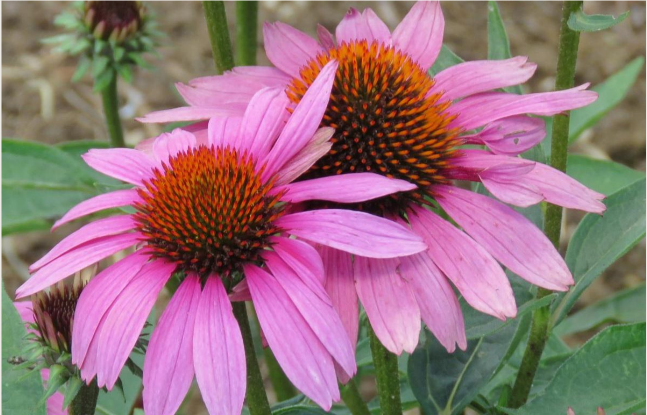
Coneflowers in Bloom