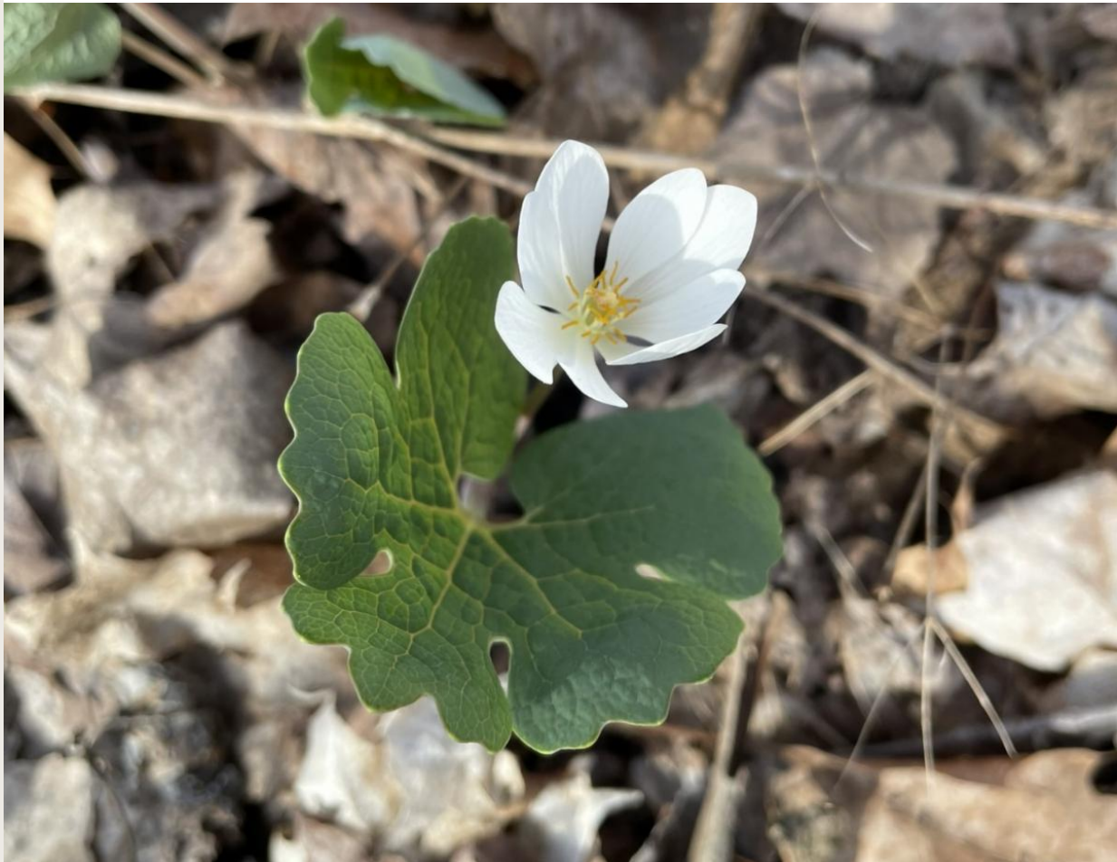
Sanguinaria canadensis (Bloodroot) - Headwaters Trail