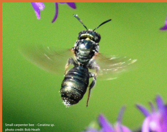
Small carpenter bee - Ceratina sp.