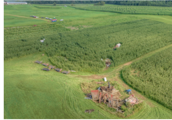
Pictured: A barn that was destroyed and dispersed throughout the field in Mantua Township (top photo) Large hail from late August storms (bottom photo).

The EMA broke ground on it's new offices including the County's Emergency Operations Center and renovation of Station 30 which houses specialty emergency response apparatus and equipment/supplies. We look forward to moving in September of 2024!