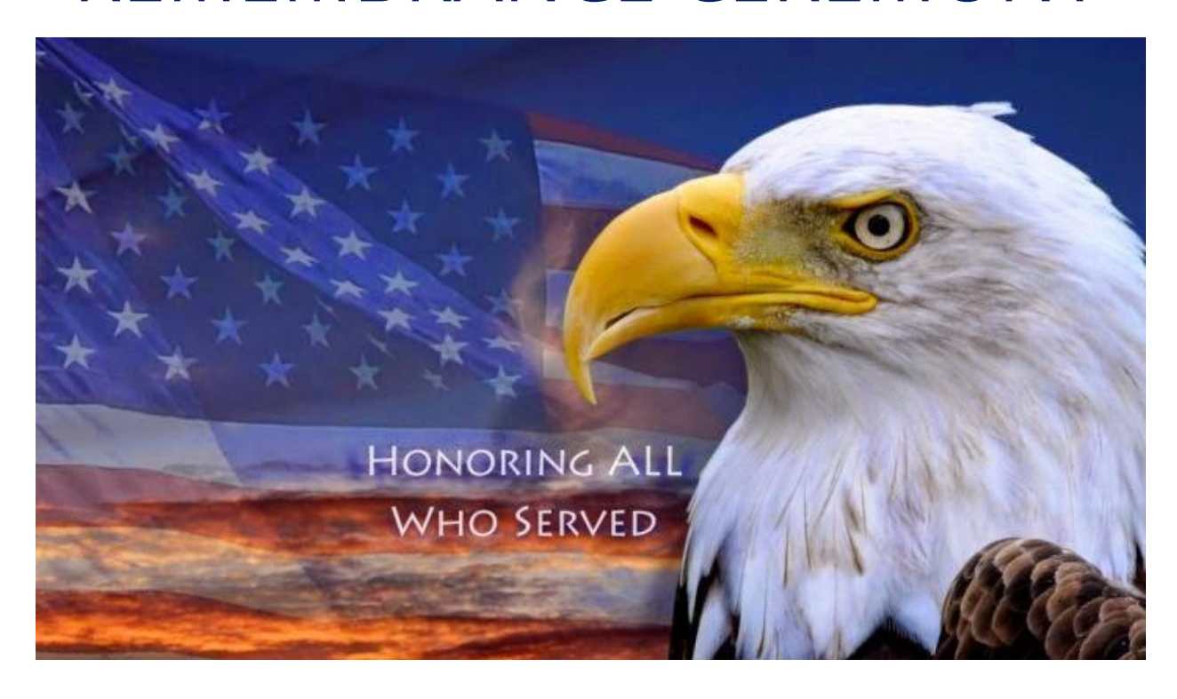
Please Join Us On Saturday, November 11, 2023, at 11:00 AM Ravenna Courthouse Lawn