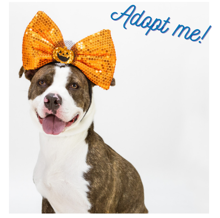
See P.6 for more information on adoption!

This year we remained focused on initiating positive change. Several changes included updating technology; modernizing the workplace atmosphere; upgrading the service delivery model; improving workplace culture; collaborating with elected officials; establishing best practice employment policies and procedures as well as developing strategic plans for the future.