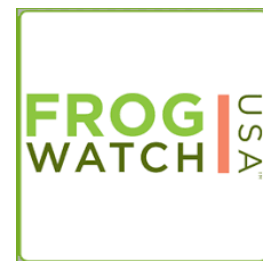
FrogWatch USA Volunteer