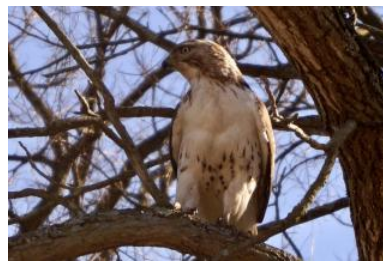
Discover Red-Tailed Hawks-