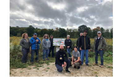
Spring Into Health March 12 @ 10 AM

The days are getting longer, and the weather is warming up! Now is the perfect time to get outside. Join UH hospitals for blood pressure readings and tips on how to make the most of your time outside.