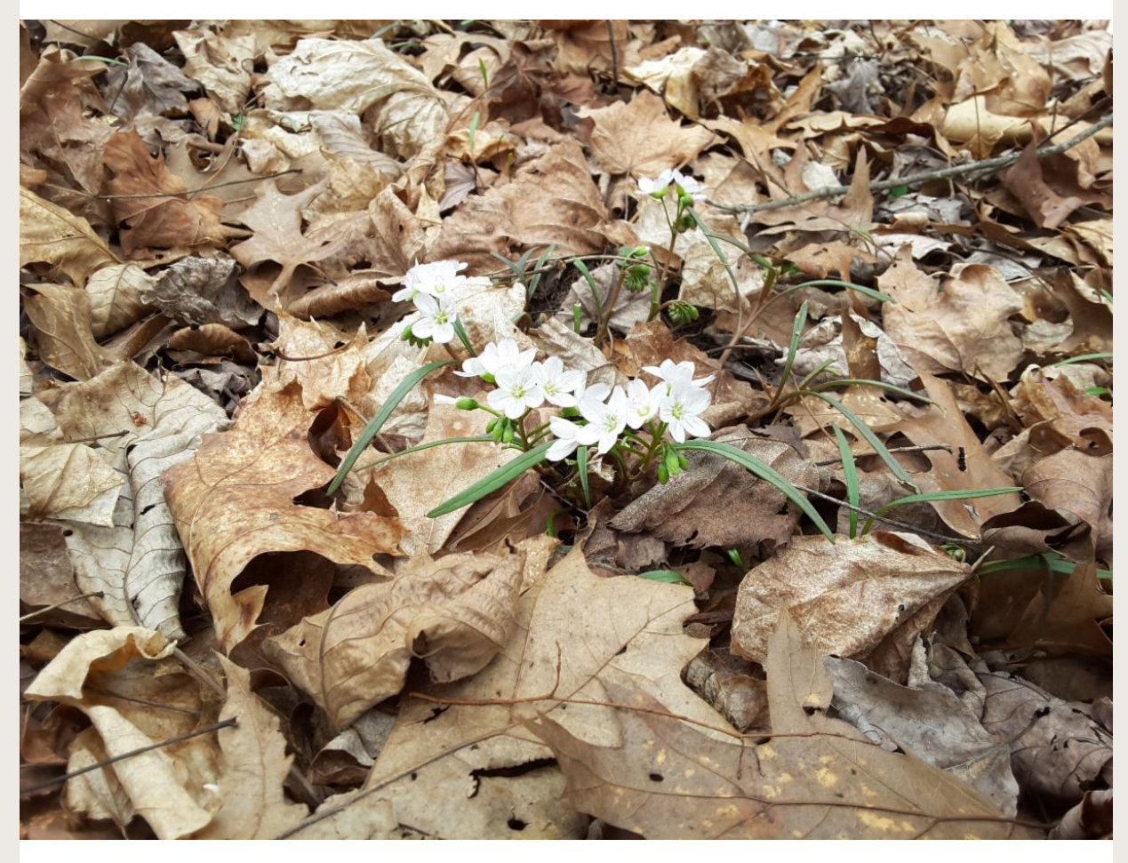
Spring Beauty - Shaw Woods Park