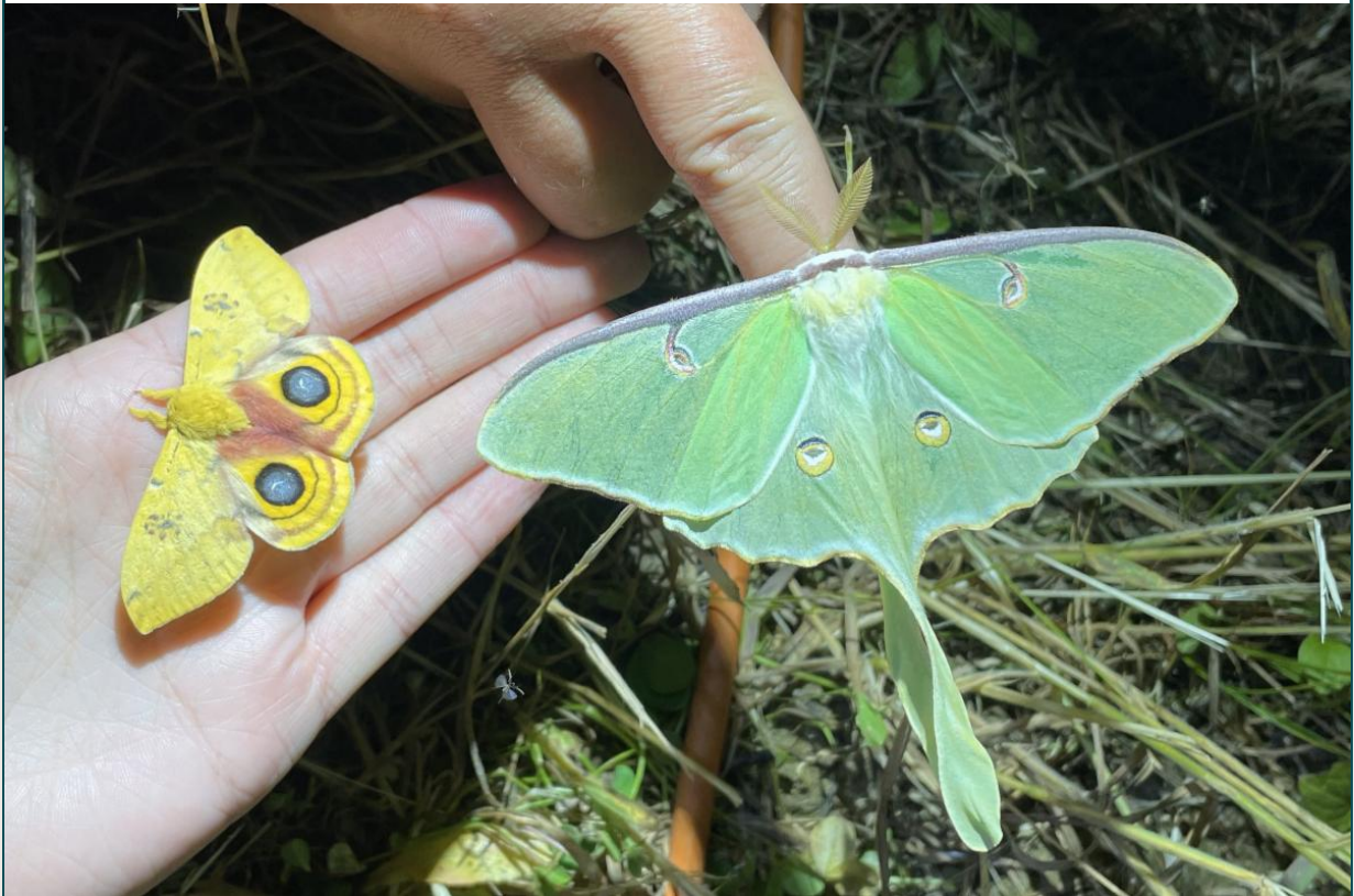
Io Moth & Luna Moth - Eagle Creek Greenway Preserve