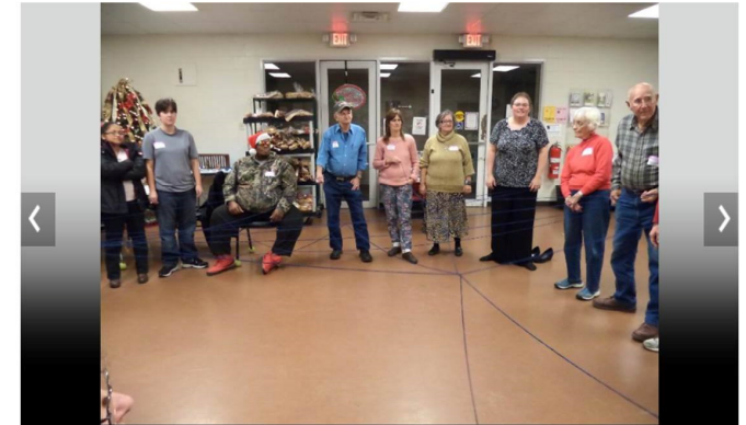
Members of the Ravenna Community Time Bank engage in a team-building exercise at the group's recent potluck dinner at the Center of Hope in Ravenna.